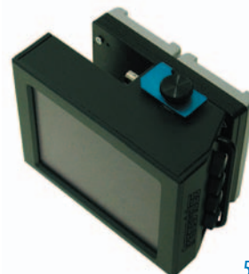
5" Rainbow II with Smart Mini DV battery back