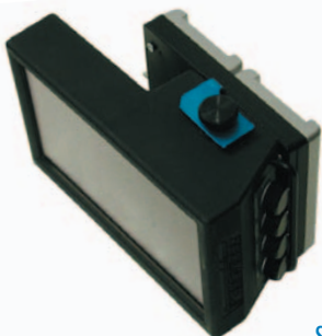
16/9 Rainbow with Smart Mini DV battery back

This external accessory snaps-on and is secured to the monitor thanks to a 1/4-20 knob. The Smart Mini DV battery back steps up 7.2v Mini DV batteries to 12v DC. Excessive discharge of Mini DV batteries may cause the charger to no longer recognize the batteries, or to damage them. Transvideo Smart MiniDV battery backs feature a sophisticated voltage protection system preventing over-discharge of the Mini DV batteries. It will also shut off automatically when the voltage is too low. The Smart Mini DV battery backs provides an On/Off switch to easily cut power to the monitor, without removing the batteries. It also features an LED indicator: Green: power on, Orange: low battery, Red: auto shut-off. The Smart Mini DV battery backs offer two sockets and may be used with one or two batteries. 5 models of Smart MiniDV battery back exist to accommodate Canon, Sony, Panasonic, JVC, Samsung, and Hitachi mini DV batteries.