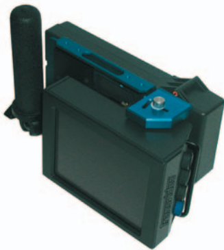
16/9 Rainbow with NP1 battery/ Handle back: