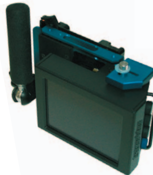
5" Rainbow II with Anton- Bauer battery/ Handle back.